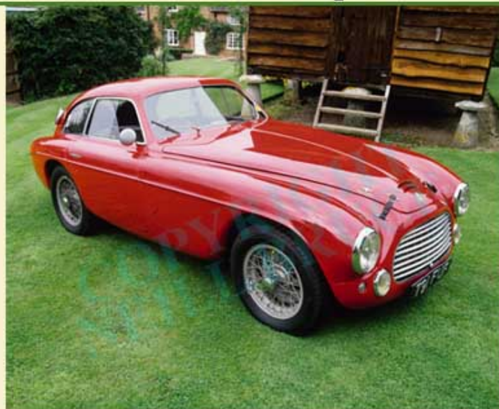
980703 C wide