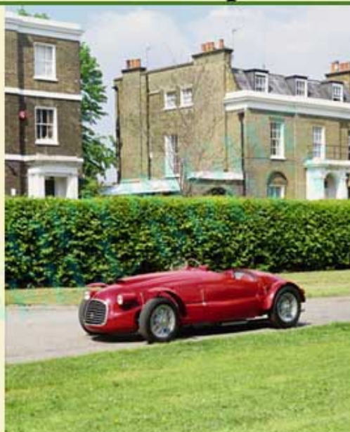
567 TR up