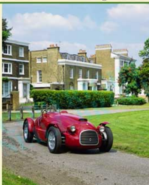
567 TL up