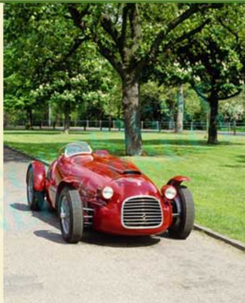
567 B up