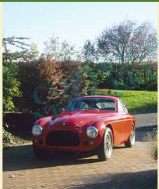
011114 B up