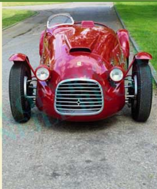
567 A up