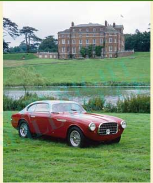
412 BL up