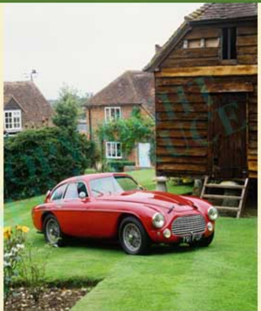
980703 C up