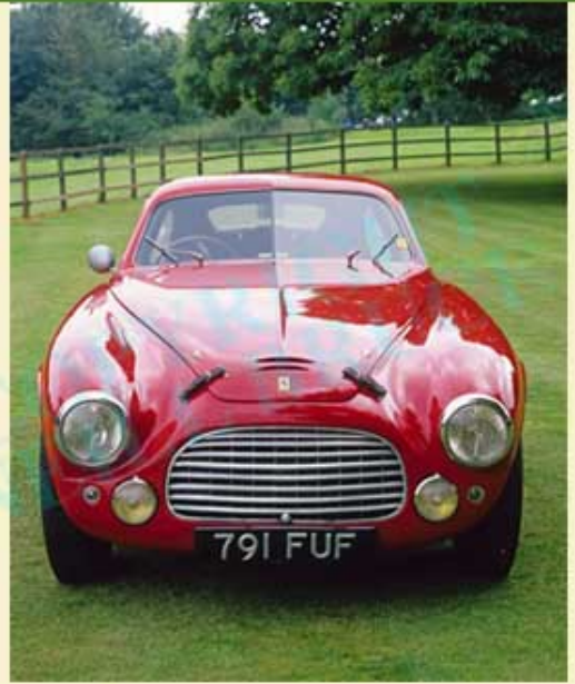
980703 A with shadow lifted